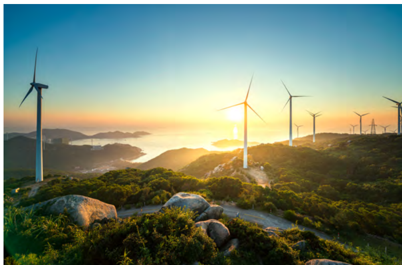
Wind turbines in China.

Among the most prominent UN agencies, the UN Industrial Development Organization