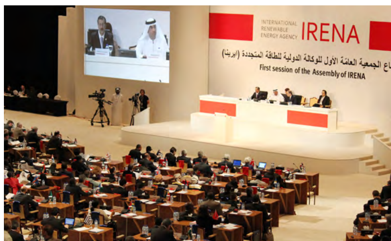
The inaugural session of the International Renewable Energy Agency (IRENA) Assembly was held in April 2011 in Abu Dhabi.

After much lobbying and with interest in renewable energy increasing worldwide, Germany convened a preparatory process in 2008, which resulted in the founding of IRENA a year later. Following a highly