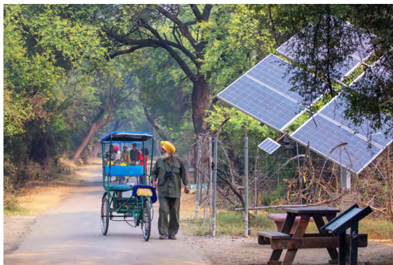
Solar panels in Keoladeo Ghana National Park in Bharatpur, Rajasthan, India.

KANDEH YUMKELLA, UN SECRETARY-GENERAL'S SPECIAL ENVOY FOR SEforALL, 2013–2015.