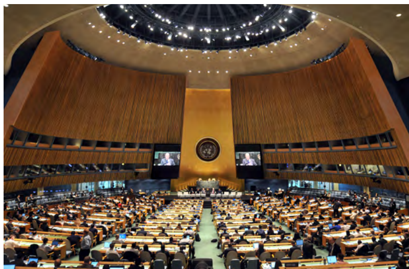
The first-ever SEforALL Global Ministerial Policy Dialogue convened at UN Headquarters in New York in May 2015.

SEforALL is a unique international organization. Its principal governing body, the Administrative Board , is comprised of leaders