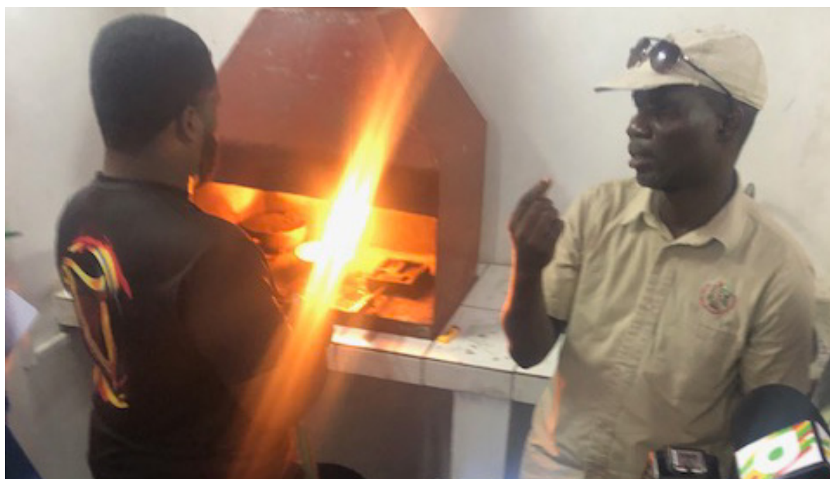
FIGURE D1. A miner using fume hood in Guyana

recovered through copper plates and gravity separation for eventual burning to recover the gold. Whole-ore amalgamation is an inefficient practice as its gold recovery is low, and the process results in major losses of mercury to the tailings (Veiga et al., 2006). This mercury is eventually released into the environment, resulting in long-term environmental impacts. In addition, miners exposed to mercury will suffer long-term irreversible health impacts.