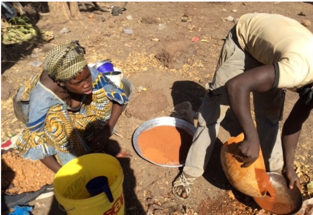
FIGURE 2. Metal pan and calabash in Mali

Next to rivers, dams, and streams, ASM miners can be seen panning (see Figure 2) for minerals (typically gold or diamonds), and they also use elementary (homemade) sluice boxes to concentrate ore from sediments in waterbodies. More equipped operations will use excavators to extract large amounts of mineral-bearing sediments. Some miners use dredges with high-suction pumps to extract ore from riverbed deposits. Without access to dredges, miners in the Democratic Republic of the Congo (DRC) and Sierra Leone, for example, build dikes with sandbags in the middle of the river to divert the water and extract ore from the drier isolated side. This method is dangerous, as dam breaks have caused miners to drown (Priester et al., 2010). ASM miners also dive into waterbodies to extract gravel using buckets and bags, though often without the necessary diving equipment. The extracted minerals are hauled onto a canoe-like structure that floats on the surface. This method is risky because the miner can drown or sustain injuries due to improper protection equipment. A technique called “hydrauliccking,” which uses a high-pressure pump to dislodge ore from highly weathered slopes of eluvial and alluvial deposits, is commonly used by miners in Guyana and the DRC (Hustrulid, 1998).