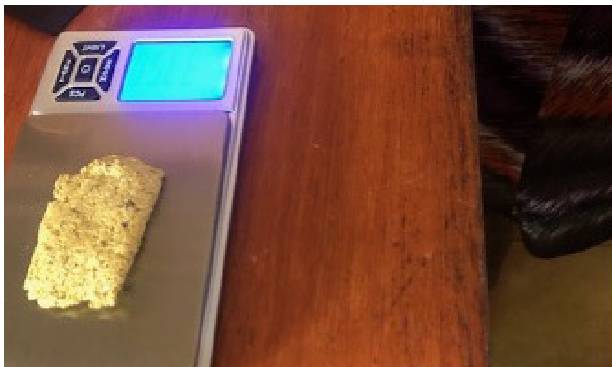
FIGURE 8. Digital scale in Guyana

ASM-mined minerals and metals are sold in a variety of ways. In a number of countries, governments have set up buying centres where they evaluate mineral products and buy from registered miners. For example, the Entreprise Générale du Cobalt in the DRC was established to buy cobalt from ASM operators, and the state mining company in Chile, Empresa Nacional de Minería (ENAMI) , buys ores or concentrate from small-scale copper miners. In Ghana, the state-owned Precious Minerals Marketing Company buys gold and diamonds from artisanal miners. In Zimbabwe, Fidelity Printers and Refiners , wholly owned by the Reserve Bank of Zimbabwe, buys gold produced by artisanal miners, and the Minerals Marketing Corporation of Zimbabwe facilitates access to the market for other minerals produced by artisanal miners, such as chromite, tin, tantalite, and tungsten. Government buying centres employ diverse analytical techniques, including microscopes, atomic absorption spectrometers, fire assay facilities, and X-ray fluorescent spectrometers (XRF), to assess material grade, 13 determine prices, and enhance traceability 14 within the supply chain.