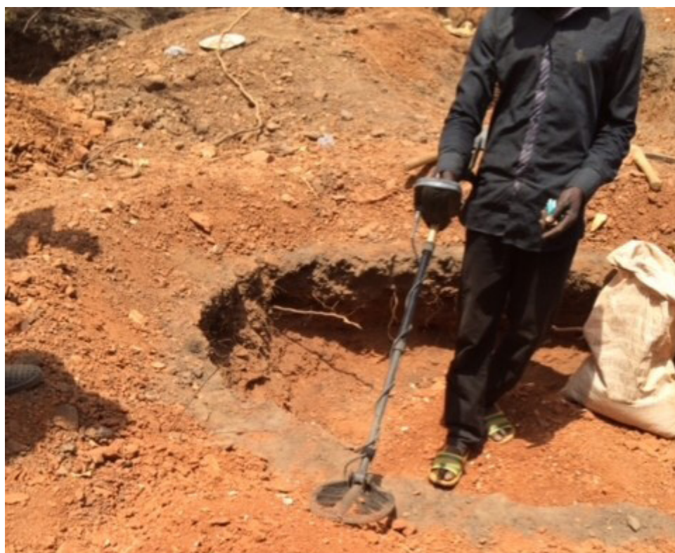
FIGURE B1. A metal detector being used in Mali

Many resource-rich countries have yet to conduct adequate geological mapping to determine their mineral resources. Where geological information is available, the coverage of the available geological data is limited to areas that have already been prospected, explored, or allocated to large-scale mining (LSM) operations. Access to geological data is important for a number of reasons. From a governmental perspective, it can assist with the allocation and enforcement of ASM areas. From the perspective of an ASM operator, having access to usable geological data can save time and money and take the guesswork out of prospecting. Having access to geological data can reduce encroachment on LSM concessions, decrease environmental degradation, and result in better economic outcomes for miners.