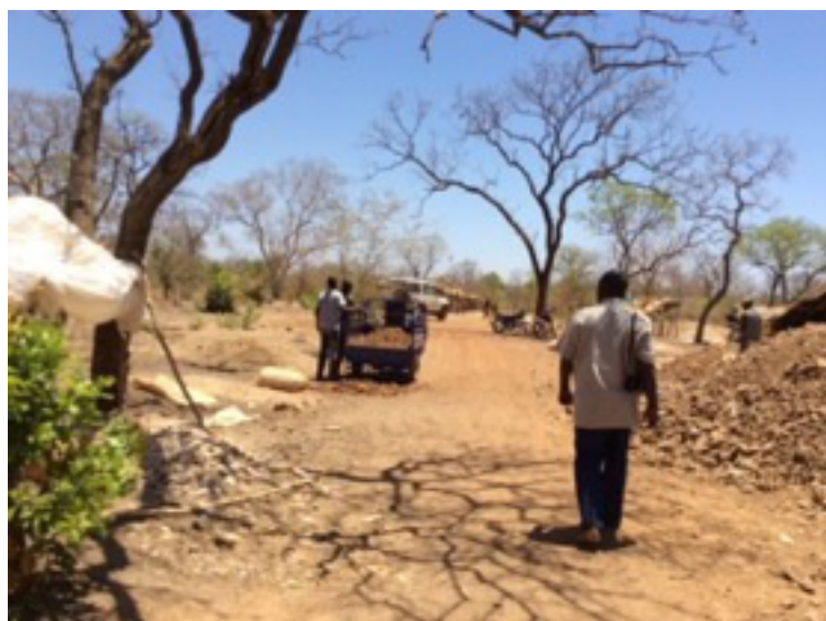
FIGURE 5. A three-wheeler carrying ore in Mali