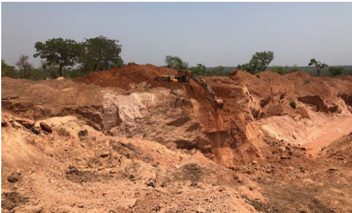
FIGURE 4. An excavator used in ASM in Guinea