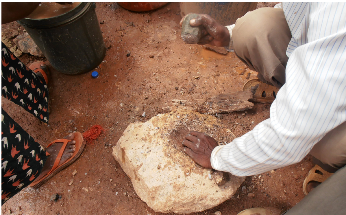
FIGURE 6. An ASM miner crushing using a rock in Tanzania

The gold recovery process encompasses three main stages: comminution, mineral separation, and refining, each employing various technologies.