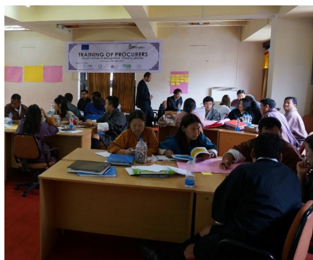
Training of public procurers at the Royal Institute of Management