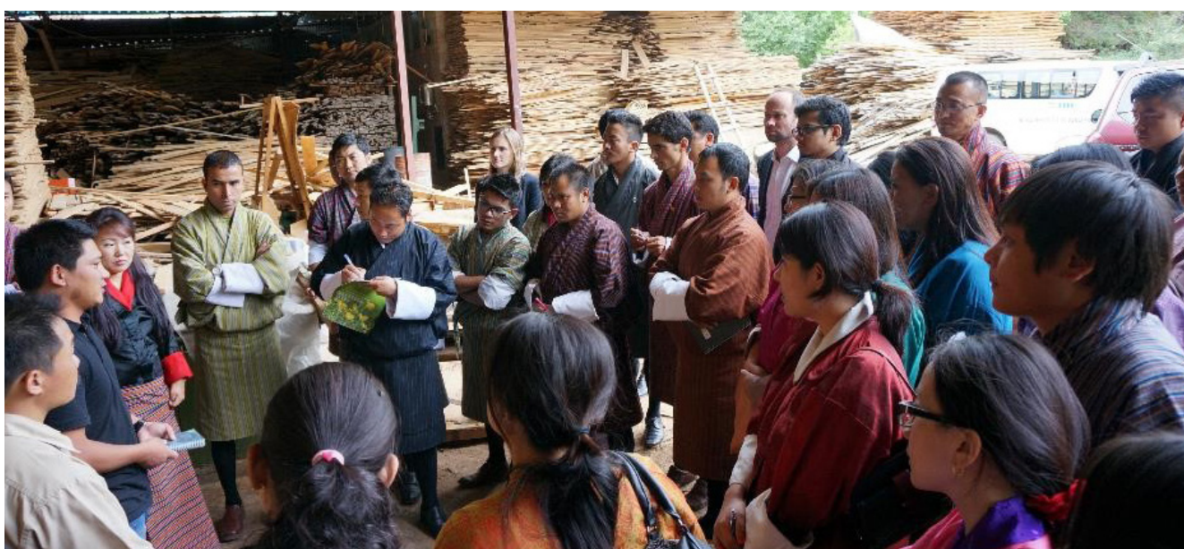
Field visit to wood-based products industries during the Training of Public Procurers

The GPPB team developed handbooks that provide bespoke guidance for public procurers, green product criteria for frequent areas of public spending (e.g., air conditioners, apparel, paper) and criteria for green infrastructure (e.g., green roads, building and hydropower plants). The handbooks and criteria became base material for training public procurers at the RIM. Three pilot projects benefited from technical assistance on the projects and tendering procedures during the course of the project: two with the City of Thimphu, and one with the Department of Engineering Services of the Ministry of Works and Human Settlements. The GPPB team also provided inputs to a review of the Bhutanese Standard Bidding Documents in line with international best practice and the new Procurement Framework of the World Bank . They were extensively discussed with the National Environment Commission in Bhutan. The GPPB project made positive contributions to the requested changes to the bidding documents that are currently under review by the Ministry of Finance.