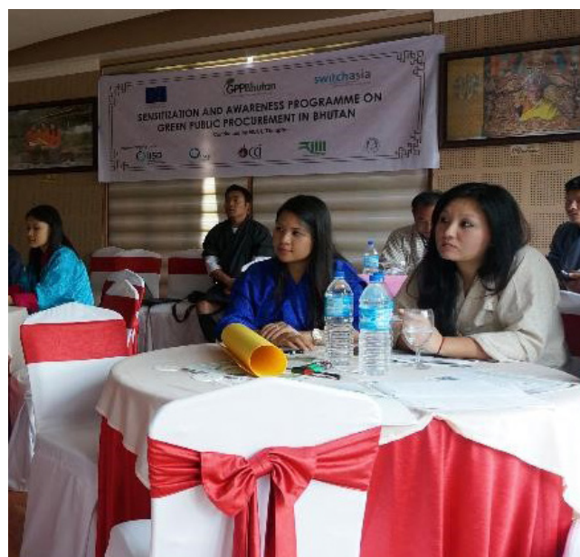
Sensitization and awareness raising for the construction industry in Bhutan