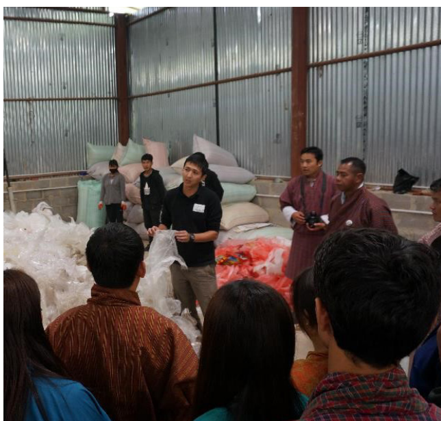
Field visit to Green Road to understand how to recycle plastic into the bitumen mix for the Bhutanese roads. Field visit during the Training of Procurers